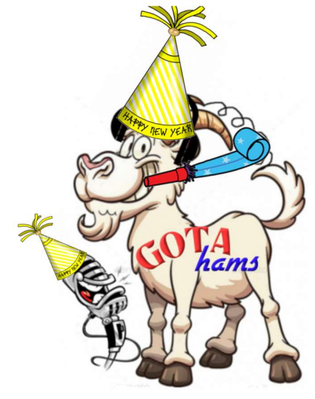
GOAT NOTES JANUARY 2021