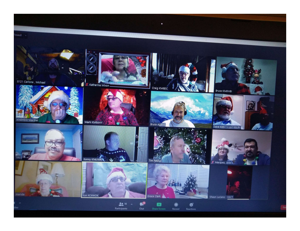
GOTAHAMS ZOOM Christmas party