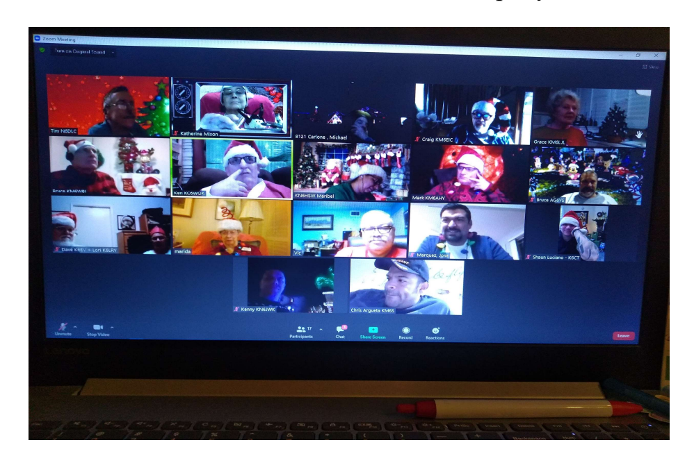
And the rest of the herd looking great in their festive gear