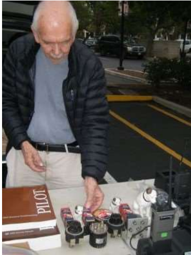
RCA Victor Memorabilia