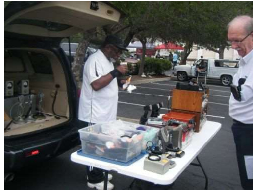
Astatic D104 Lollipop Microphones