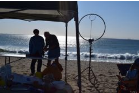
He experimented with reception using a loop antenna.